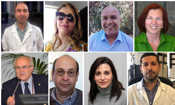
Bartolomeo, Beltifa, Ben Mansour, Di Bella, Dugo, Lo Turco, Potorti, Saija

Science , 83: 1769–1774. https://doi.org/10.1111/1750-3841.14171 . Cited 19 times.