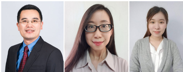
Yang, Kong, Sow

Sow, L.C., Kong, K. and Yang, H. (2018). Structural Modification of Fish Gelatin by the Addition of Gellan, \kappa -Carrageenan, and Salts Mimics the Critical Physicochemical Properties of Pork Gelatin. Journal of Food Science , 83: 1280–1291. https://doi.org/10.1111/1750-3841.14123 . Cited 35 times.